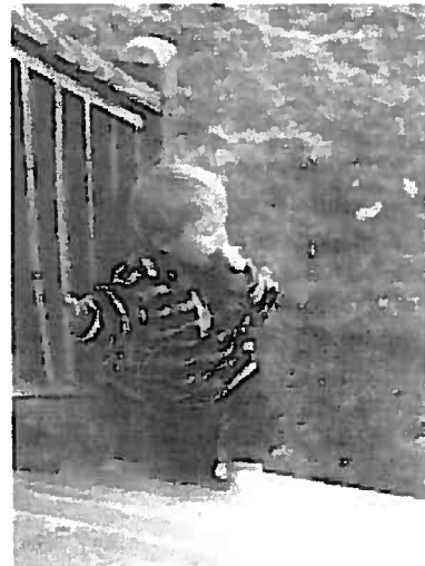
Children touching unsealed treated wood, and then putting their hands in their mouths is the biggest concern.

Too much arsenic can cause cancer. So it is good to prevent arsenic getting into your body when you can. When you touch wood treated with arsenic, you can get arsenic on your hands. The arsenic on your hands can get into your mouth if you are not careful about washing before eating. Young children are most at risk because they are more likely to put their hands in their mouths. The good news is that there are simple things you can do to protect yourself and your family from arsenic treated wood. This fact sheet will tell you how.